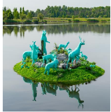
(1) Space Cube , Marie-Eve Martel (arrondissement Québec 2018) (2) When Paper Planes Stop Catching Wind (Montréal 2021) (3) Happy Castaways , Demers-Mesnard, (Longueuil 2019)

Each year, astonishingly unique works of art travel from the Quebec City public art circuit PASSAGES INSOLITES to other cities in Canada and across the world. Created by contemporary artists from here and abroad, each installation reinvents the urban experience by fostering new perspectives upon the places they inhabit. PASSAGES INSOLITES ignites the imagination through the discovery of unusual art installations that will transform your experience of the city.