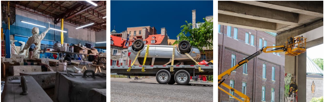
Credits: Stéphane Bourgeois_EXMURO (1) Workshop, (2) Lawn Cars , Benedetto Bufalino, in progress (3) I am the light , Ulrika Sparre, in progress.

EXMURO arts publics is a non-profit organization whose mandate is to design, create, and disseminate contemporary art projects in public spaces. Since 2007 EXMURO has constantly explored new avenues for presenting public artworks in the city. Through a range of projects, EXMURO works to expand the artistic possibilities of public spaces by reaching out to audiences to spark dialogue and foster critical thinking. For EXMURO, public art affords a freedom of experimentation and expression that is a necessary counterweight to the forces of standardization and pragmatism that govern so many facets of urban life. By weaving artworks into the urban fabric, we create possibilities to break through uniformity and standardization to create original and surprising experiences and encounters.